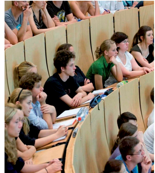
Mainz Research School of Translational Biomedicine (TransMed)